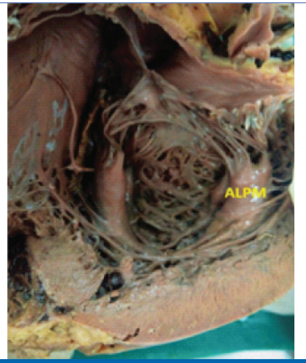
[Table/Fig-7]: Anterolateral Papillary Muscle (ALPM) showing single base with bifid apex.