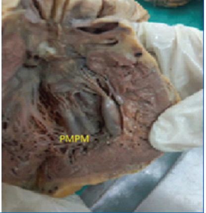
[Table/Fig-1]: Measurement of length of papillary muscle with digital vernier calipers; [Table/Fig-2]: Anterolateral Papillary Muscle (ALPM) seen in two groups; [Table/Fig-3]: Posteromedial Papillary Muscle (PMPM) seen in two groups. (Images from left to right) CT: Chordae tendinae; PMPM: Posteromedial papillary muscle; ALPM: Anterolateral papillary muscle; LV: Left ventricle; TC: Trabeculae carneae; PMPM: Posteromedial papillary muscle